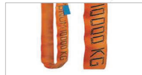
Magnum & Magnum Plus Round Slings (MG)