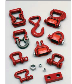
Sling Saver Fittings