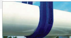
Supra Plus Round Slings (S)