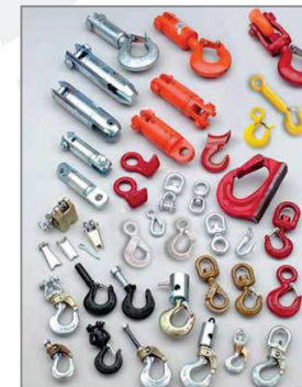
Hooks and Swivels