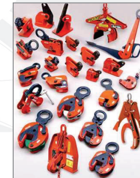
Crosby Lifting Clamps