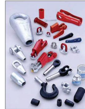
Wire Rope and Fittings