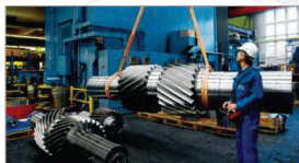
Magnum X Round Slings (MGX)